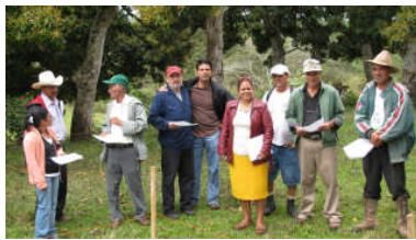
Building site for new dry beneficio; cooperative members review layout

Construction for the new building that will house the processing center is now in full swing. The mill will incorporate the following functionality: